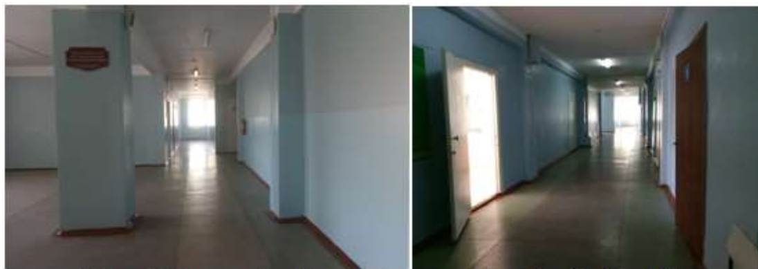
Figure 1. An example of the mainstream secondary school in Kazakhstan, Astana. The Figure illustrates the general environment in halls and corridors as seen by visitors.

It is up to the school administration and teachers to ensure that whenever anyone enters the school they are greeted with a smile, and made to feel welcome. The information displays can be translated into three languages, Kazakh, Russian and English and be in a large print. The school staff can also make sure that displays in halls and corridors reflect the life of the school as a community (see Figure 1). For example, there could be photos of pupils working together at the lessons, some photos from school trips or holidays. It would be ideal if these photos also celebrated ethnic, cultural, gender and other diversities of pupils and staff.