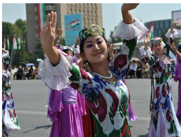
Khujand 2011. Traditional/Soviet clothes?