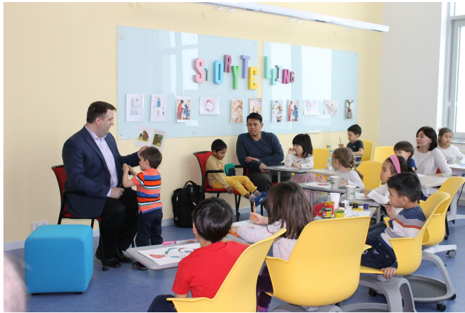
Children's Reading Room