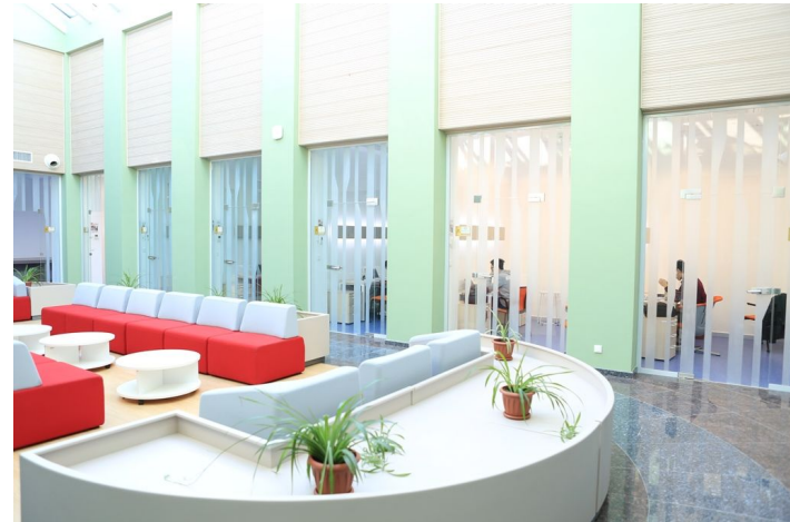
Individual Study Room / Family Room