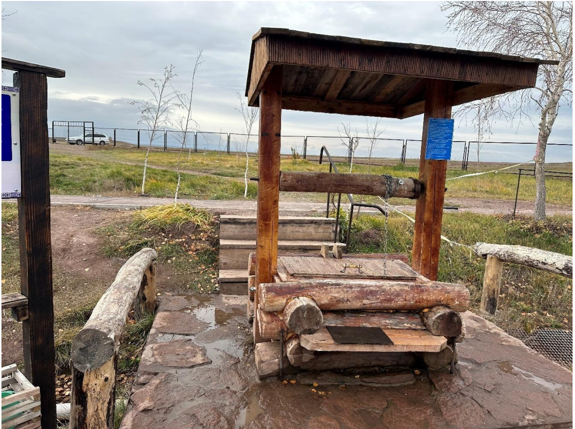
Figure 9. The well on the sacred spring Sarybulaq, October 2023