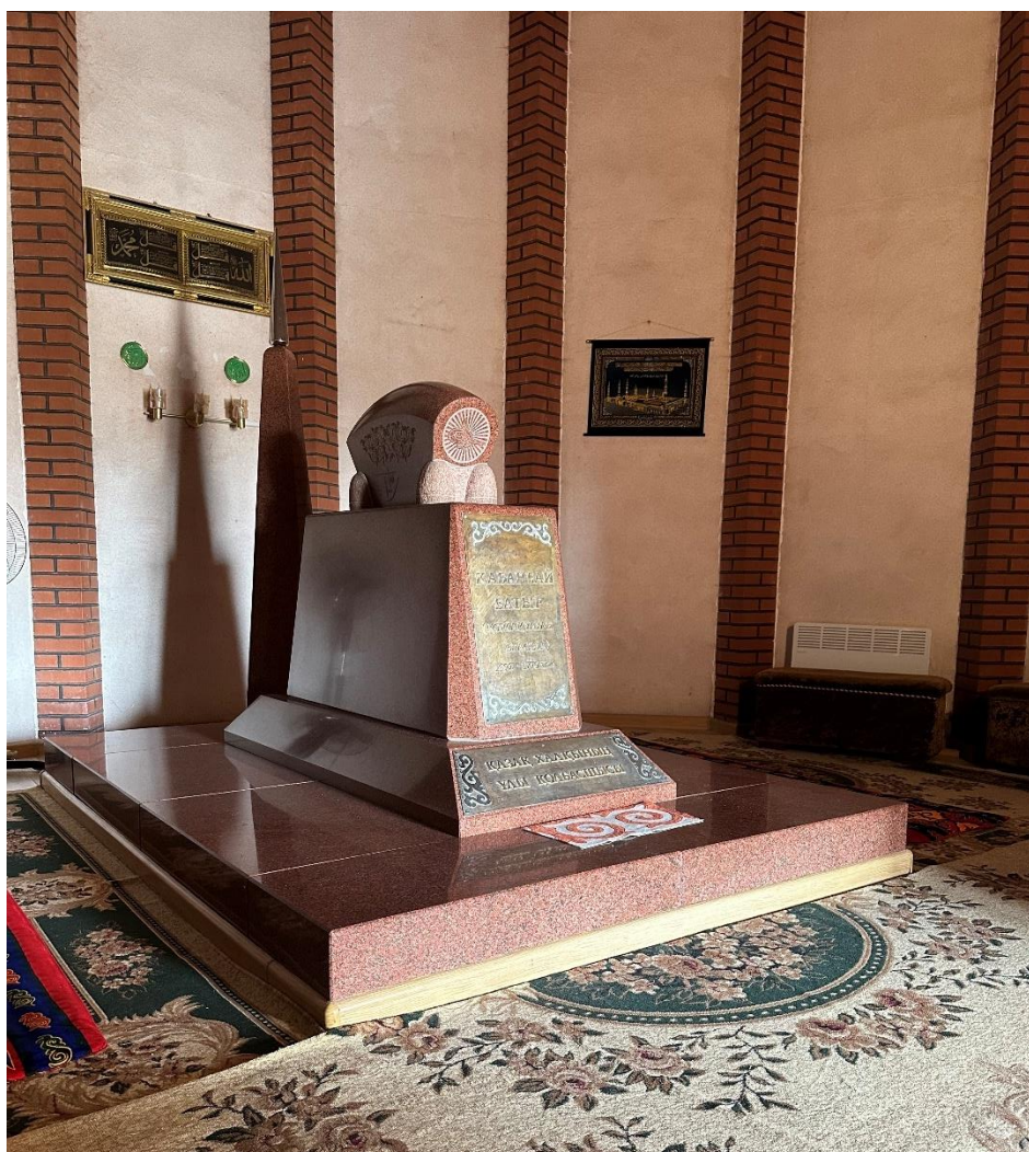
Figure 10. Qabanbay Batyr's gravestone inside the shrine, October 2023

have different meanings, whip, for example, in many cases brought by women shamans baqsy , who use it as the instrument of their work. They believe that praying at shrine helps to clean the qamshy and gives it the energy of the place. However, not only baqsy , but different people could have and bring it, highlighting the importance of the whip in Kazakh culture, and claiming that it should be in every house.