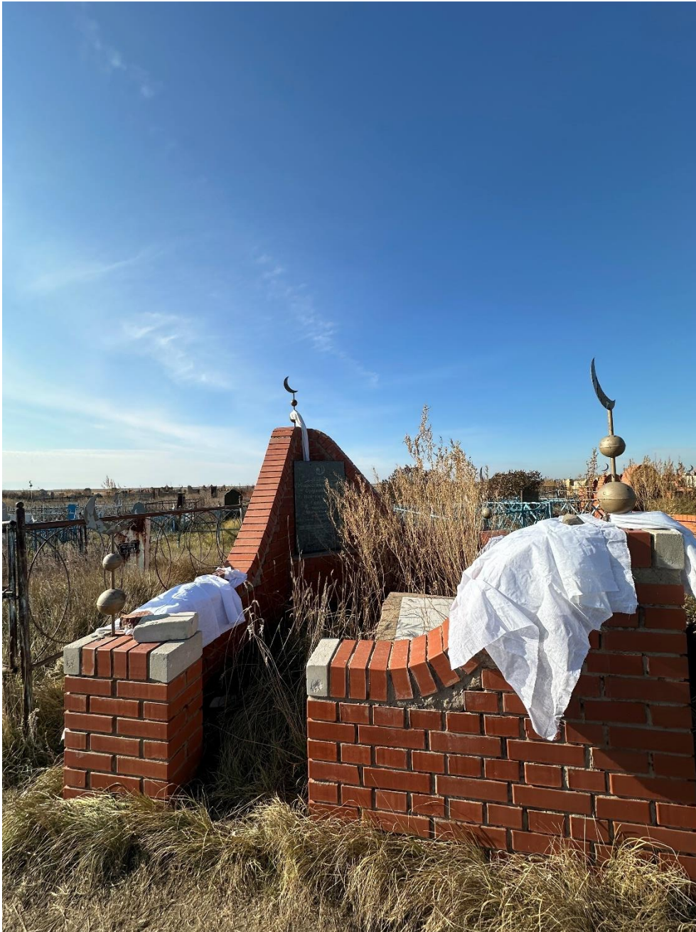
Figure 14. The white fabric aqtyq on the Ormanbet Bī's grave, part of Bes Ata , October 2024

Beyond fabric offerings, donations play a crucial role in maintaining shrines and supporting their upkeep. Other rituals include the animal sacrifice Qurmaldyq , sharing meals, and receiving blessings bata . While I've heard about these rituals but didn't see them in Qabanbay Batyr's shrine. As I understand, the pilgrimage fees include the cost of an animal