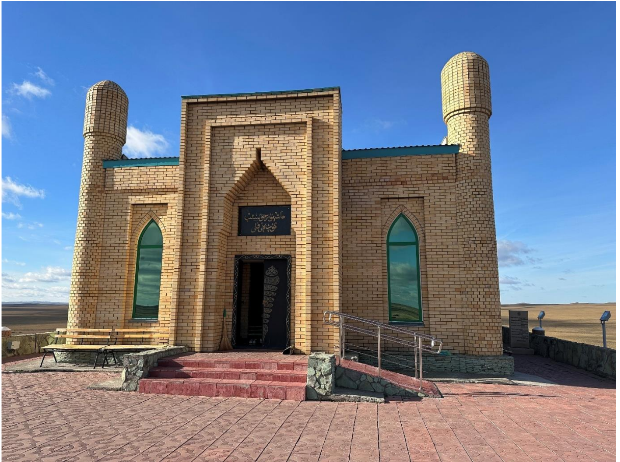
Figure 7. Mäshhür Zhüsip Köpeyuly's shrine, October 2023

A significant addition to the complex is the Mäshhür Zhüsip Köpeyuly's Memorial Museum. Initially housed in one of the guesthouses, the museum was later relocated to a dedicated building. The museum exhibits the personal belongings of Mäshhür Zhüsip, family heirlooms, and other historical artifacts in its first large hall. The second hall serves as a reading room, housing various books written by and about Mäshhür Zhüsip, as well as literature on Bayanaūyl, religion, and other related topics. Handmade crafts created in his memory are also on display, and visitors have the opportunity to purchase books at the museum.