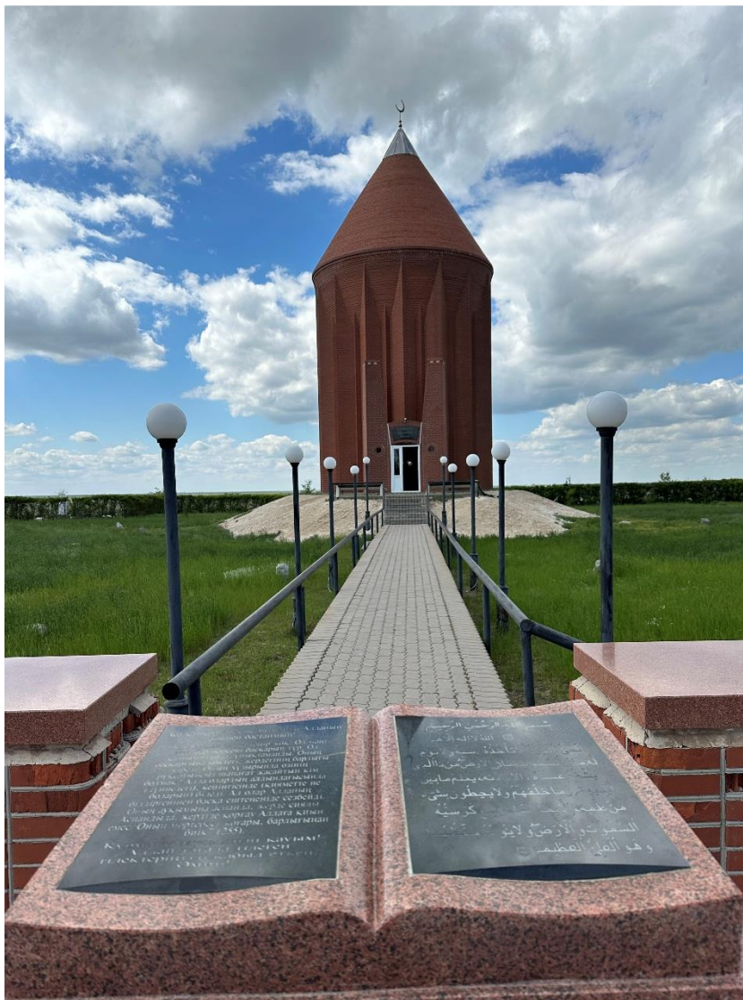
Figure 1. Qabanbay Batyr’s shrine, June 2024