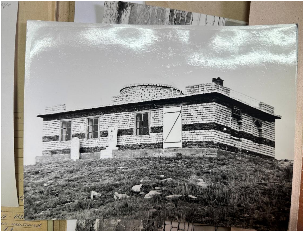
Figure 5, The photo of mazar, 1981