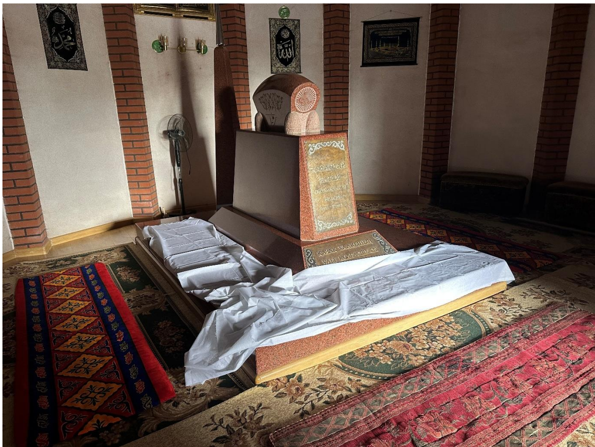
Figure 13. White fabric brought by pilgrims to Qabanbay Batyr's shrine, September 2023