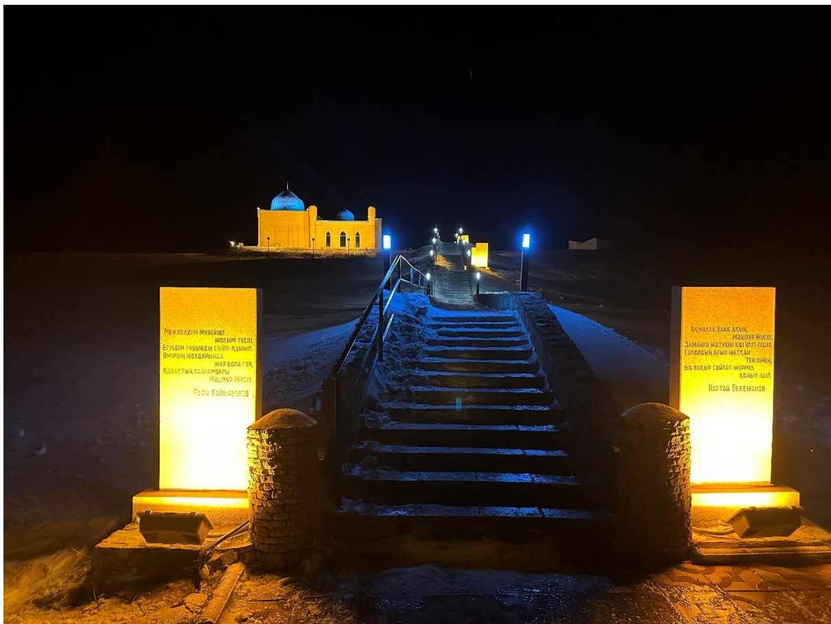
Figure 6. Mäshhür Zhüsip Köpeyuly's shrine in the winter evening, January 2024