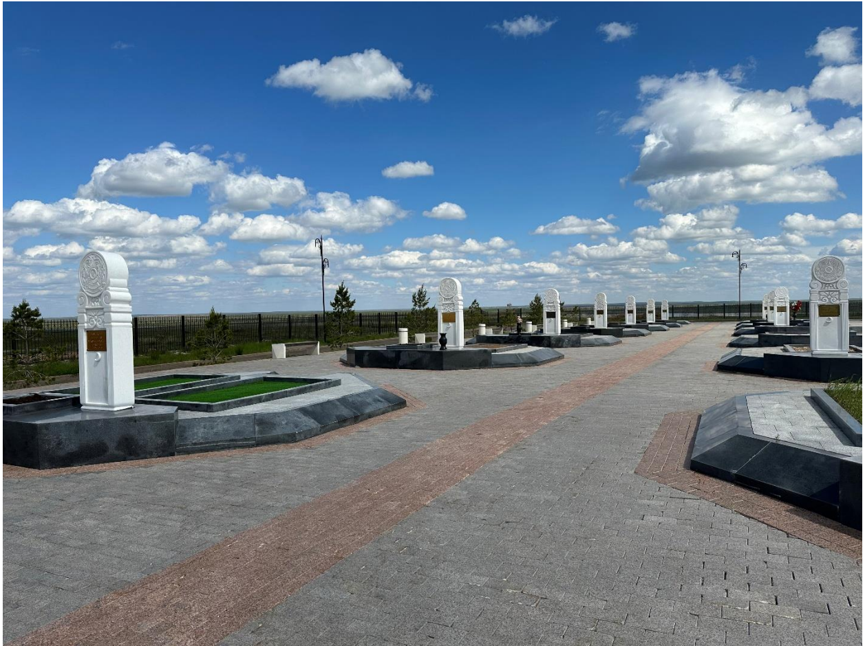
Figure 2. The National Pantheon, June 2024

As of August 2024, a total of 27 individuals have been buried in the National Pantheon.