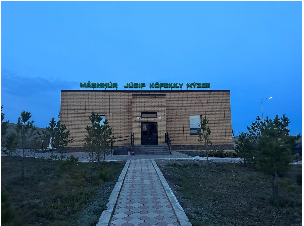
Figure 8. The Memorial Museum of Mäshhür Zhüsip Köpeuly, October 2023