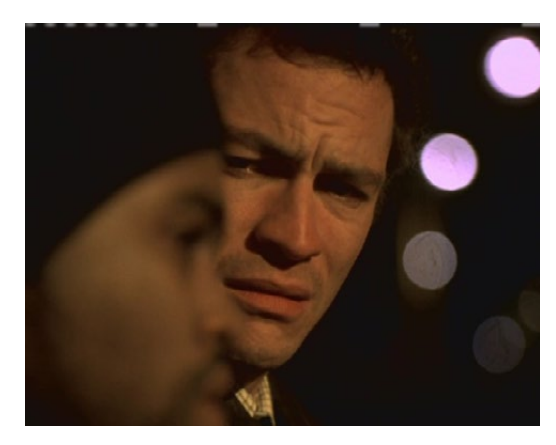
Image 7: The Wire : McNulty struggles to understand a senseless death