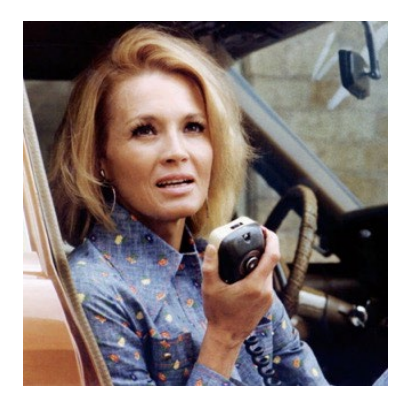
Image 3: In Police Woman , femininity is linked with incompetence and victimization.