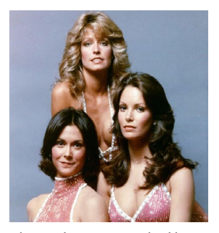
Image 4: Charlie's Angels combines decorative glamour and competent teamwork to deliver an ambivalent message about women's strength.