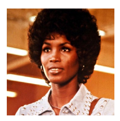
Image 2: Get Christine Love! emphasizes the main character's competence and confidence.