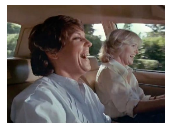
Image 6: Cagney & Lacey , Season 2: the opening sequence emphasizes the detectives' friendship

These exercises provide demonstrable evidence of the key premise of the course, that strength and competence are on some level culturally understood to be incompatible with femininity. We may not have