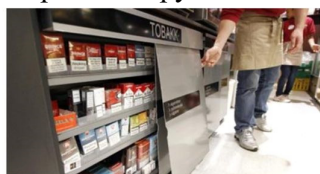
Cabinets with doors