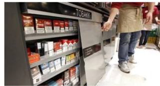
Cabinets with doors