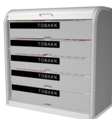
Shelves with flaps