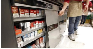
Cabinets with doors