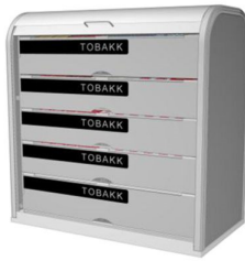
Shelves with flaps