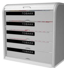
Shelves with flaps