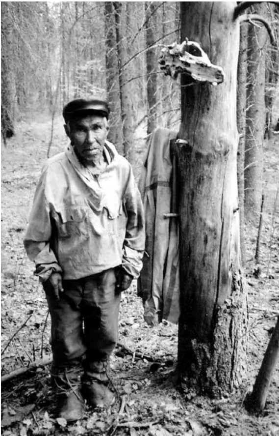
Khanty elder demonstrating how items are discarded in the forest behind the yurt settlement, 4 Bolshoi Yugan 2004.