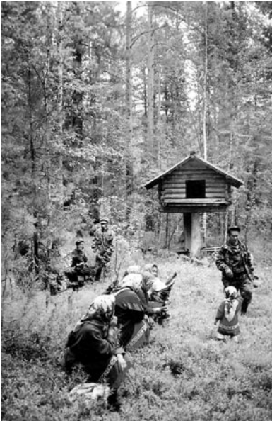
Community visit to a local shrine, 3 Malyi Yugan 2004.

At certain times in the year each yurt community visits its local shrine, where carved idols are housed in a labas (a stilted structure on legs). The visits are an important time for coming together, discussing concerns, and giving thanks not just to the local deity, but also to other deities on the river. These deities, which reside in different areas of the land and in the various realms of the wider universe, are invited to attend via prayers and recitals. In this way, the events are an important time not only for reaffirming ideas about the world, but also for linking the local group into the much wider inhabitation of a broader sacred landscape. Gender roles are also strictly enforced, including the exclusion from certain areas, or even entire landscape zones, for fear of insulting the spirits there.