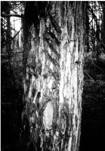
Carvings in a cedar tree commemorating a bear hunt, 2 Malyi Yugan 1998.