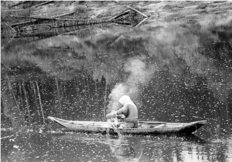
Setting nets on the Bolshoi Yugan River in August, 2003.

Thus, despite the official organizations and economic structures of the Soviet period, there were always strong indigenous dimensions to life, especially in the deeper forest. Even on the summer fishing migrations, when all upriver families engaged in collective fishing on the lower river, families carried certain important deities in their boats to provide for mutual protection while away from home. After the post-Soviet collapse of expeditionary fishing in the early 1990s, the tradition changed to housing the dolls for some weeks, not at the local sacred site but in the yurt, thereby transforming the land within the yurt into a sacred landscape. In the same way that it is forbidden to walk around other sacred sites out in the landscape, while the idols are resident in the yurt, it is forbidden to walk around the building housing the deities.