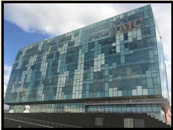
The NU School of Medicine